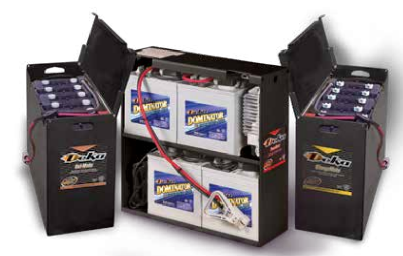
Gel-Mate® PowrMate® ChargeMate®

No matter the application or the truck, Deka has the perfect battery for your Class III truck needs. We offer direct replacement products with on-board chargers with over 130 custom models available in multiple capacities from 155-510 AH. These products excel in multiple demanding applications such as heavy duty, high vibration and cold storage. In addition many can be used in Opportunity Charging and some are maintenance-free.