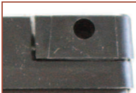
Individual Cell Venting System