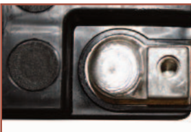
Exclusive Molded Terminal Design

The East Penn AUX Battery is specially designed and uniquely capable to deliver dependable auxiliary support to critical vehicle functions. Premium AGM technological innovation optimizes valve-regulation and recombination efficiency through an individual cell venting system. This ensures unquestionable reliability while maximizing cycling performance. A durable, reinforced case, cover, and terminal design further protect the battery's critical performance in almost any location of the vehicle.