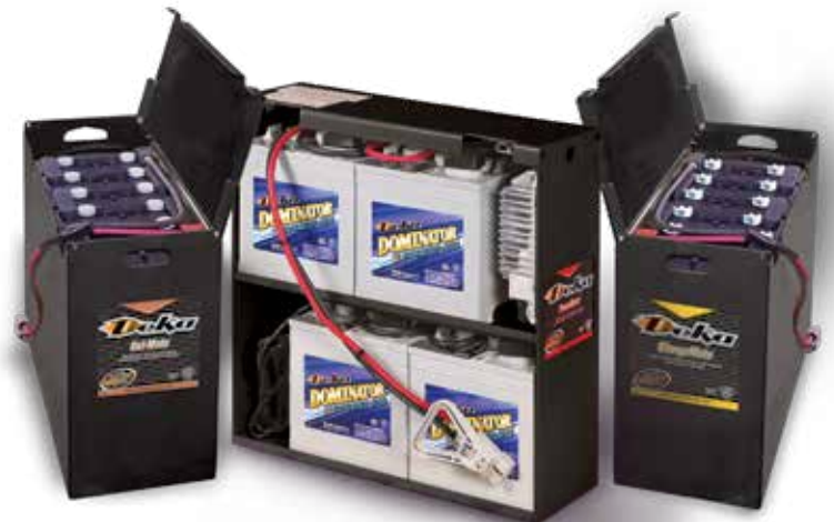
Gel-Mate® PowrMate® ChargeMate™

No matter the application or the truck, Deka has the perfect battery for your Class III truck needs. We offer direct replacement products with on-board chargers with over 130 custom models available in multiple capacities from 155-510 AH. These products excel in multiple demanding applications such as heavy duty, high vibration and cold storage. In addition many can be used in Opportunity Charging and some are maintenance-free.