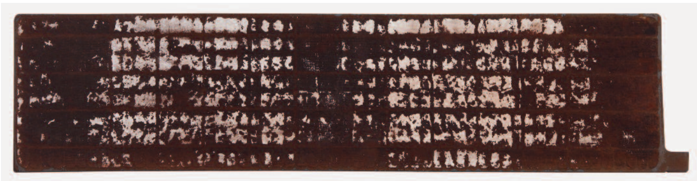
Competitor's plate formed in the battery case. White areas indicate plate is not fully formed.

a mixture of sulfuric acid, water, and a specially formulated lead oxide. Deka Unigy VRLA battery oxide is made with pure virgin lead (99.99%) and manufactured with a proprietary and exclusive formula made on-site at its own oxide mills. A unique computerized mixing system allows the combination of these materials to be precisely mixed into a paste-like consistency. The paste is uniformly and automatically applied to the grid by computer-integrated pasting