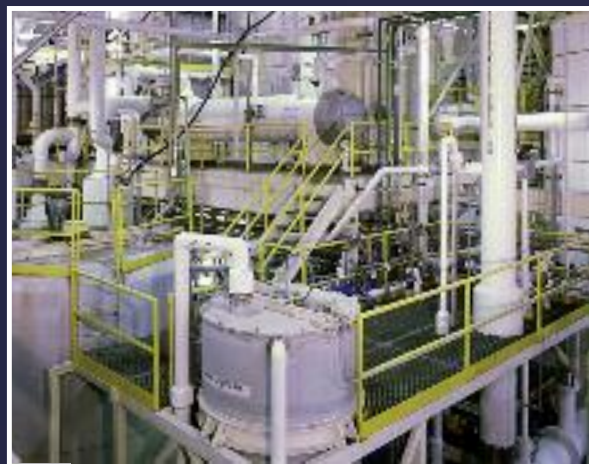
Wastewater Treatment Plant

The company's modern facilities as well as its long-standing "green" culture has made East Penn the most environmentally conscious proactive battery manufacturer and recycler in the world.